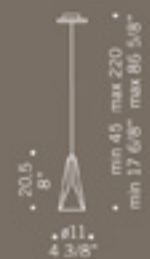
LOLLI S1 1x40W G9 alogeno bispina halogen bi-pin