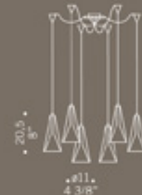
LOLLI S6D 6x40W G9 alogeno bispina halogen bi-pin cavo elettrico 200 cm cables length 200 cm