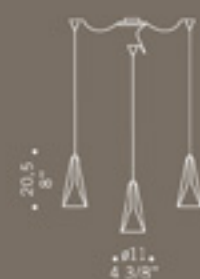
LOLLI S3D 3x40W G9 alogeno bispina halogen bi-pin cavo elettrico 200 cm cables length 200 cm