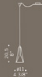
LOLLI S1D 1x40W G9 alogeno bispina halogen bi-pin cavo elettrico 200 cm cables length 200 cm