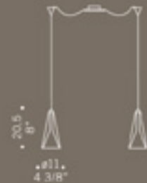
LOLLI S2D 2x40W G9 alogeno bispina halogen bi-pin cavo elettrico 200 cm cables length 200 cm